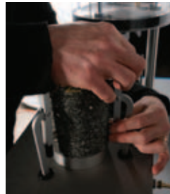
1. Place specimen in jig

The system's software and controller accurately and automatically control the confining pressure. Temperature controlled air, in the integrated pressure vessel, is re-circulated by electric fan and is regulated by an internal heat exchanger. The air temperature is measured half way up the specimen and controlled using a dedicated temperature (PID) controller that provides thermal equilibrium within three minutes of closing the cell.