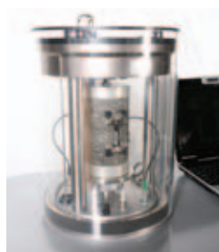
3. 360° view, testing can commence