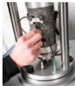
2. Mount strain transducers